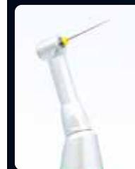
All RA Endo file