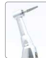
Reciprocating head 1:1 suitable for all reciprocating Proxo file