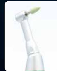
All Polishers (RA)