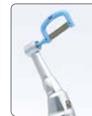
Reciprocating head 1:1 suitable for all reciprocating automatic strips