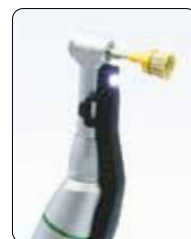
Rotating head 16:1. For all RA tools, with LED Light.