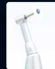
All Discs (RA)