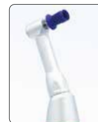
Rotating Push button head 16:1 suitable for all RA contra-angle tools